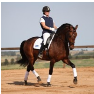
Xerxes Interagro under saddle

- The Lusitano Collection videos and literature garnered a lot of attention both weekends at the USEF Festival of Champions Selection Trials held at the USET headquarters at Gladstone. Lusitano enthusiasts from California to Canada visited the display at Sho Clothes and started thinking about plans to come to Florida next February! One fun surprise was a visit from a couple from Brazil!!