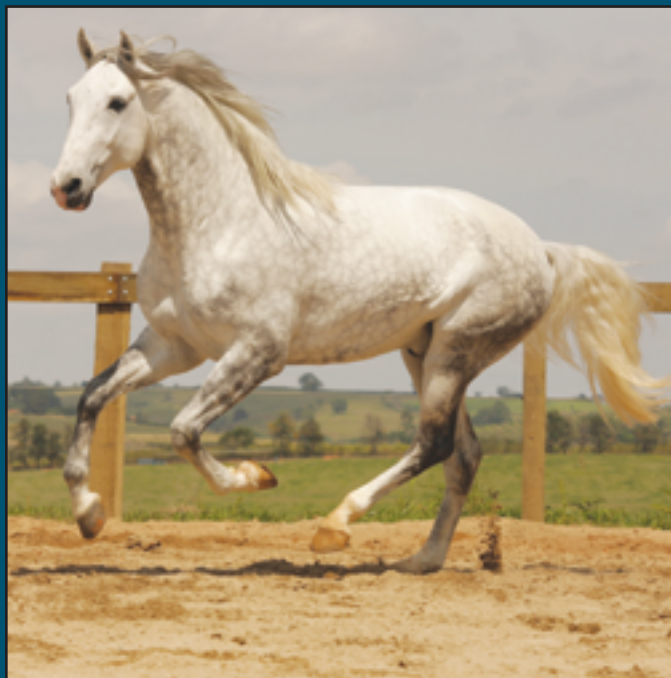
Amintas Interagro – a star of the forthcoming 2009 Lusitano Collection

In order to ensure each guest is given proper attention, the 2009 Lusitano Collection® has elected to limit the event capacity to 400 attendees. At the end of the testing period, guests will enjoy festivities in the course of the Auction that include a cocktail party followed by the Showcase Parade of Horses into a hacienda-like atmosphere complete with hanging chandeliers, water fountain and lush tropical trees. Youngest-ever Olympian equestrian, seventeen-year-old Brazilian Luiza Tavares de Almeida, who rode a Lusitano in the 2008 Olympics, will be fea-