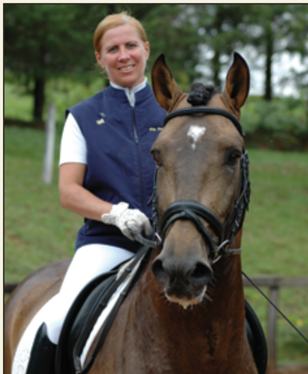
Alfacinha Interagro hopes to follow in his talented father's footsteps

The pair was ready to set the world alight and were due to represent Brazil at the Pan-American Games before an acute case of bacterial colitis struck down the grey stallion ten days before the contest. Nirvana made a miraculous recovery thanks to the on-hand veterinary care at Interagro's headquarters only to suffer acute laminitis as a