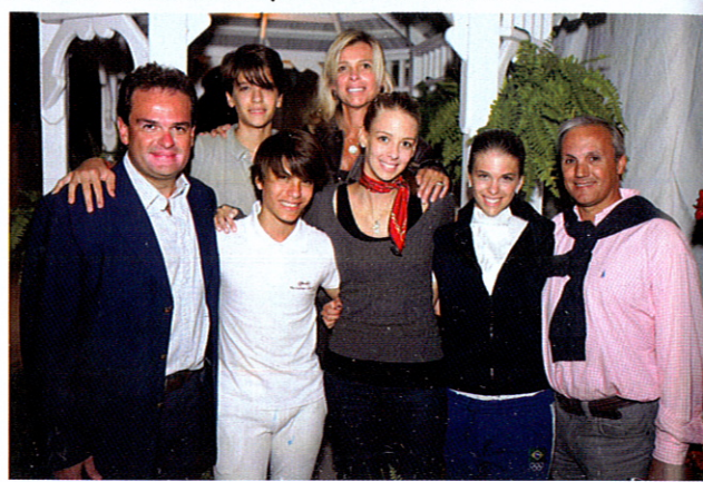
The de Almeida family with 2008 Spanish dressage Olympian Juan Matute.