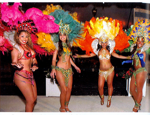
Brazilian samba dancers provided entertainment.